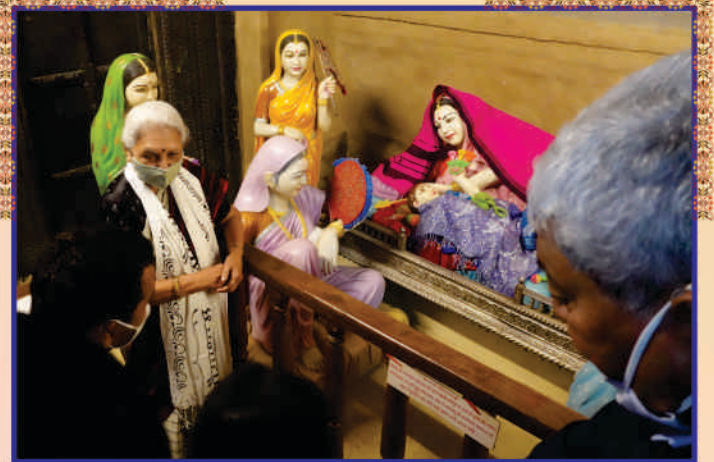
Darshan at Shri Ghanshyam Maharaj's Pragatyasthaan, Chhapaiya