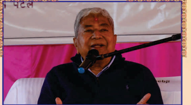
Guruhari Sahebji showering blessings